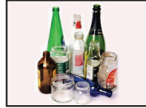
Glass (Rinsed w/o lids)