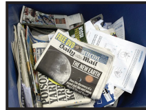
All Paper Products