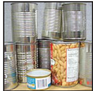
Bi-Metal Cans (Rinsed w/o lids)