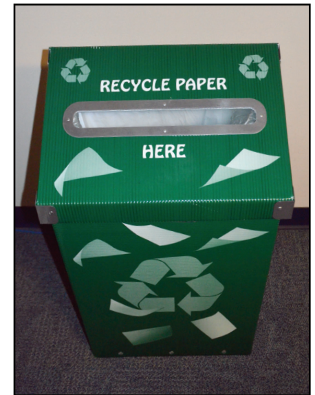
All Paper Products (Mixed)