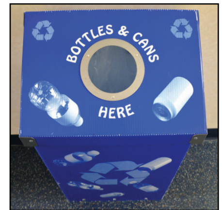
Co-mingle aluminum & bi-metal cans, glass & 1&2 plastics