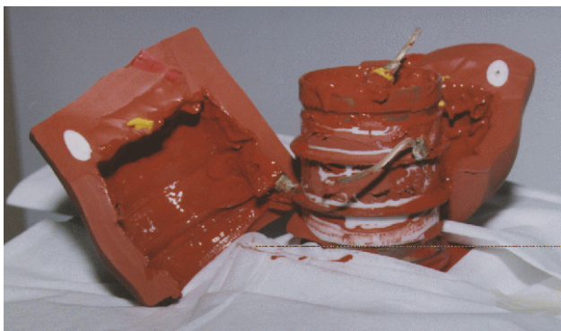
Figure 2 - Gun assembly showing degraded potting

The largest number of failures were the result of external arcs across the ceramic of the gun assembly. The gun assembly is potted with a silicone RTV to prevent problems with dust and humidity. In many cases, the RTV closest to the gun reverted to either a thick soup of silicone oil and solids or a dry and crumbling material. While the RTV was rated at 250 °C [2] and measured surface temperatures according to data provided were well below that point, silicone supplier GE Silicone felt the material was being exposed to temperatures too high.