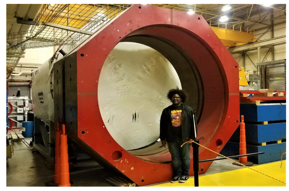
FIG. 1. CLEO-II Solenoid at Jefferson Lab.

For Hall A's SoLID experiment, the CLEO-II solenoid has been acquired, Fig. 1.