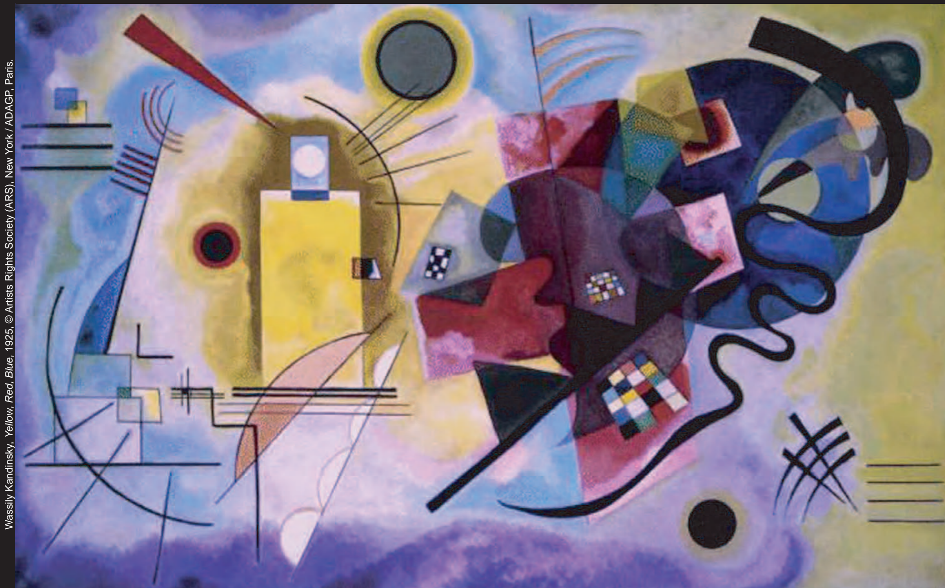
Wassily Kandinsky, Yellow, Red, Blue, 1925