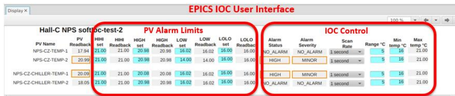
FIG.1. EPICS IOC User Interface