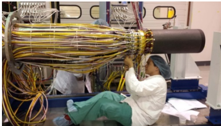
SVT cables after routing.