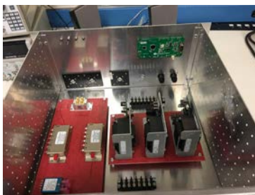
Lower Shelf of RF box Viewed from rear panel end.