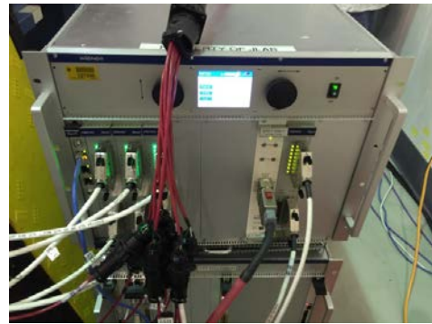
Pictures included in paper of spare modules (left) and MPOD crate (right).