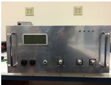
Front Panel of RF box.