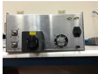
Rear Panel of RF box