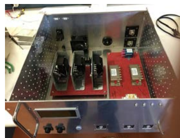
Lower Shelf of RF box. Viewed from front panel end.