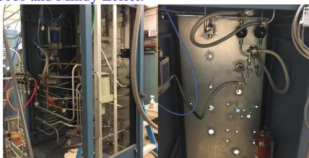
Confirmed valve specification on buffer tanks.