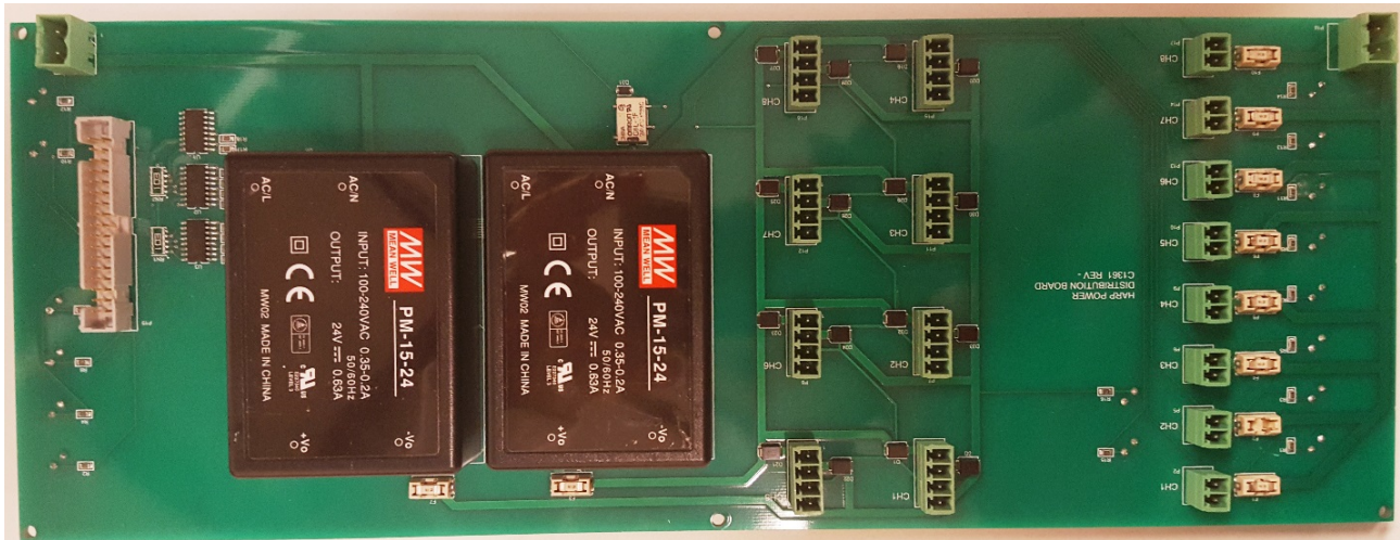
Harp power distribution board