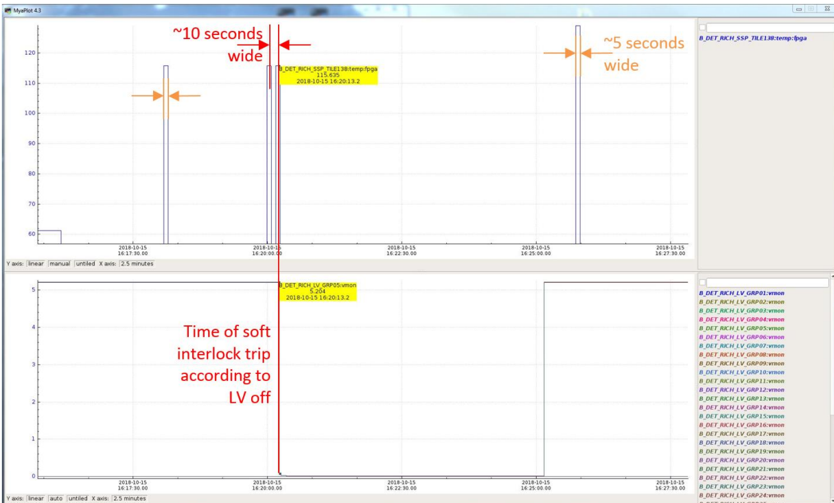
Plots from Mya Archiver showing false temperature spikes. Top plot is Tile 138's FPGA temperature. Bottom plot is RICH LV groups. LV was only disabled by soft interlocks after measuring two over-limit temperatures 10 seconds apart.