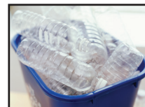
1 & 2 Plastics (Rinsed w/o lids)