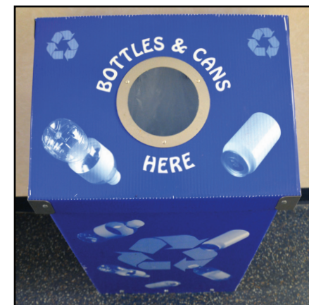
Co-mingle aluminum & bi-metal cans, glass & 1&2 plastics