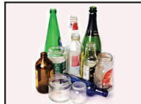
Glass (Rinsed w/o lids)