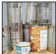
Bi-Metal Cans (Rinsed w/o lids)