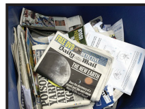
All Paper Products