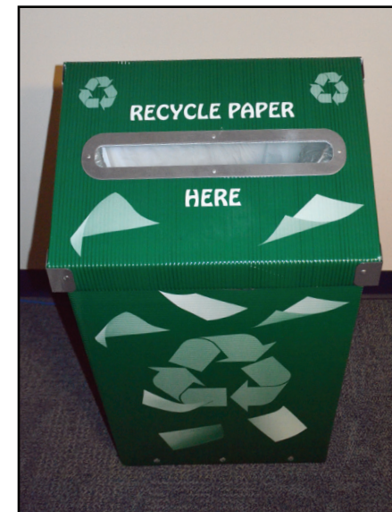
All Paper Products (Mixed)